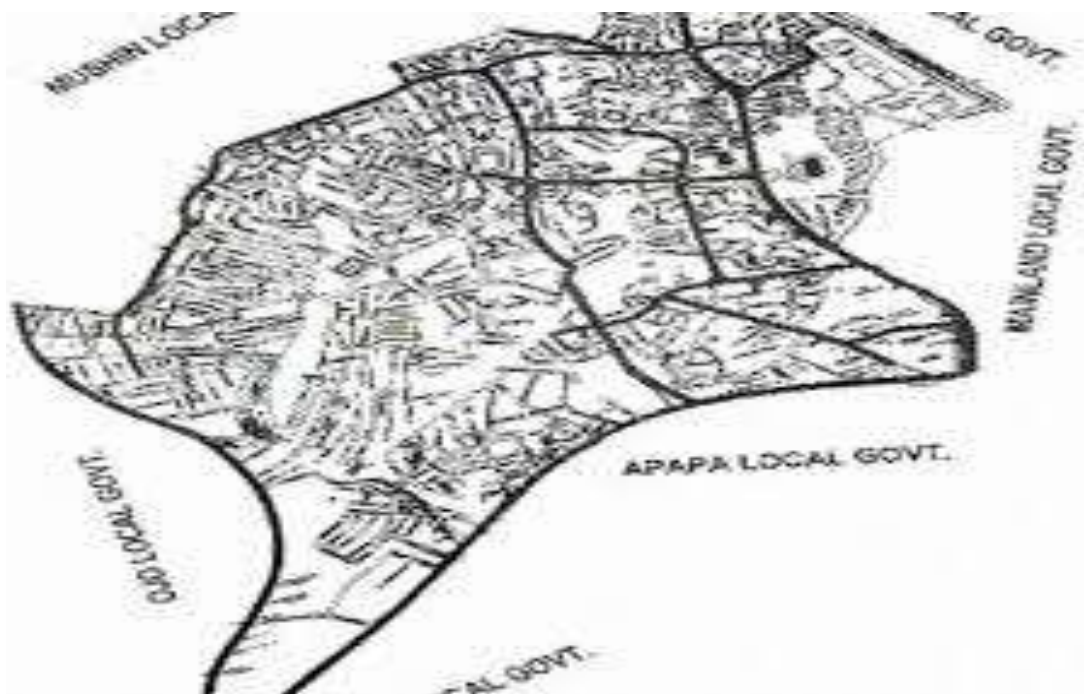
Figure 1: Map of Surulere LGA

Surulere is a residential and commercial Local Government Area located on the mainland in the southwestern part of Lagos in Nigeria, with an area of 23 km 2 (8.9 sq. miles). At the last census in the year 2006, there were 503,975 while projection for 2016-2021 is 692,500 (male; 260,509 and female; 242,365) with age range 0-9; 102,903 and 10-19; 93,591 inhabitants, with a population density of 21,864 inhabitants per square kilometer. The total number of OVC currently enrolled on the project is 7,064 (0-5yrs =1,664; 6-9 years = 1,876; 10-14 years=2,377; 15-17yrs=1,148).