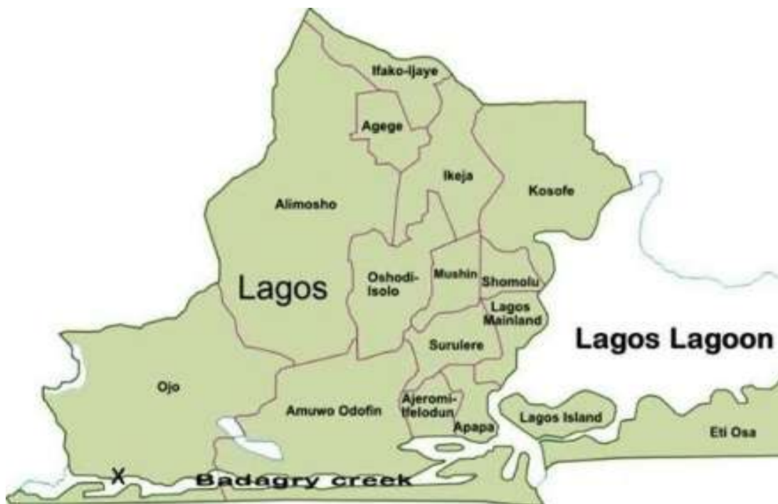
Figure 1: Map of Lagos, showing Kosofe and its neighboring LGAs.

Kosofe local government was created on the 27 th of November 1996. It is one of the twenty local governments in Lagos state. However, in October 2003, the Lagos state government created 37 Local Council Development Areas (LCDA) out of the original 20 local governments in the state as a solution to the political yearning of the people. Thus, 2 LCDA namely IKOSI –ISHERI, and AGBOYI –KETU LCDA were carved out of the old Kosofe Local Government.