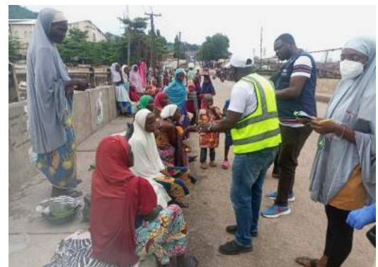
Outreach and sputum sample collection at Cantonment Kogi state.