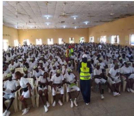
Sensitization in NYSC camp Kano