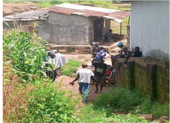
House-to-house active TB case finding in Kaduna

Sputum samples were collected from these individuals and tested in the laboratory. Nineteen thousand and sixty-five (19, 065) were positive for Tuberculosis.