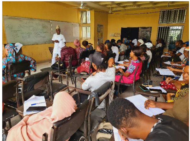
Enrolled USAID supported ICHSSA-2 Case Managers during their lectures at LASU.

The United States Agency for International Development (USAID) through ARFH, implementing the Integrated Child Health and Social Services Award (ICHSSA-2) project, in partnership with the Lagos State Ministry of Youth and Social Development (MYSD) has enrolled 40 eligible Case Managers in Lagos State on the certificate course. The candidates will receive specialized training for improved performance and eligibility for engagement by Government, for uninterrupted service provision to vulnerable children and their households, to promote ownership and sustainability, beyond the project tenure.