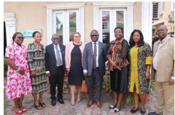
US Embassy Team visits ARFH Office in Lagos