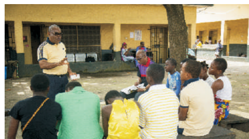
LOPIN1 DOP during Adolescent Support Group meeting in Lagos State