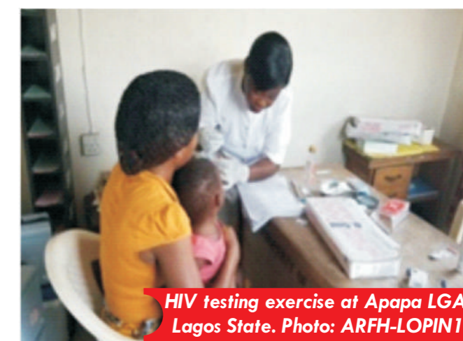
HIV testing exercise at Apapa LGA, Lagos State.

HIV testing, enrolment of HIV positives, linkage and retention to care and treatment. Other services included monitoring of PLHIV and CLHIV, treatment adherence and Viralload suppression. The LOPIN 1 innovated the