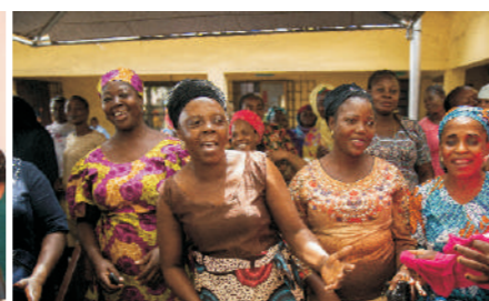
Caregivers' forum activity in Lagos State