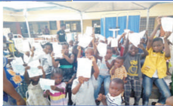
Children display their birth Certificates in Lagos State