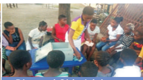
Diamond Girls Adolescent VSLA meeting in Lagos State