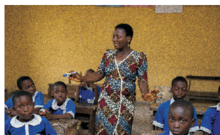
Gender Norms training at L.A primary school, Badary, Lagos State