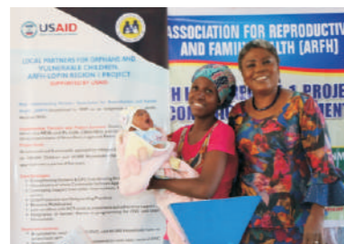
LOPIN1 Chief of Party presenting HES business Material to a Caregiver in Lagos State