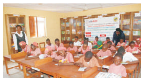
Block Grant Intervention at Irepodun Primary School provide by LOPIN1 with support from USAID