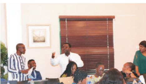
LOPIN1 TASD contributing to a session during CBO, Lagos State