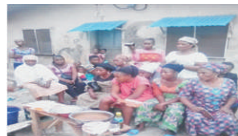
OVC Caregivers during nutrition demonstration in Lagos State