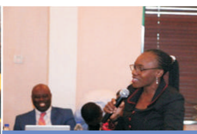
LOPIN1 SPA moderating a session during the CBO retreat