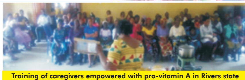
Training of caregivers empowered with pro-vitamin A in Rivers state