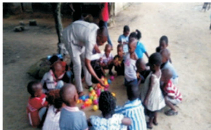
Kids club activity in Eleme LGA, Rivers state