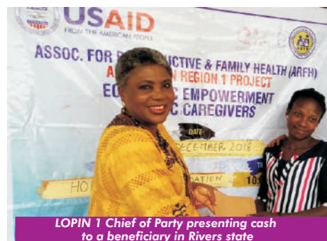
LOPIN 1 Chief of Party presenting cash to a beneficiary in Rivers state