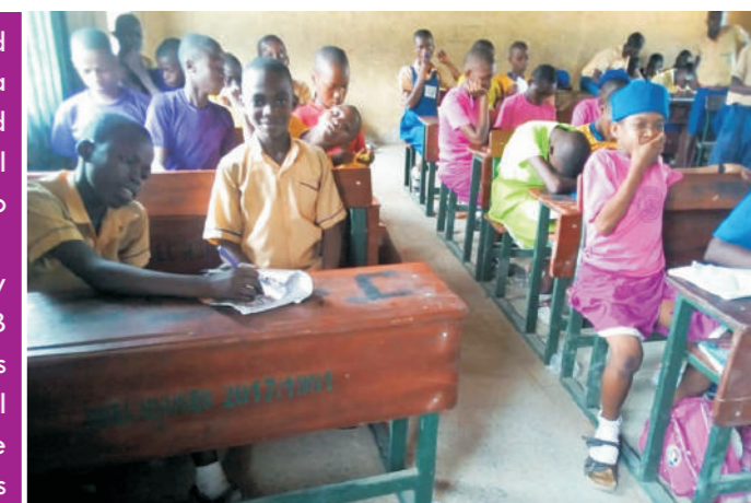
Students of Community Secondary School sitting comfortably to learn in Nkpolu, Rivers state.

ACCESS TO EDUCATION: Community Volunteers visited enrolled OVC in their respective schools at least once in a quarter to assess children's school attendance and education performance. CVs worked with school Headmasters and Principals to ensure there was no stigmatization of the enrolled children. The Block Grant interventions implemented in Fy18 by LOPIN 1 across the 3 state, in collaboration with SUBEB whereby one school which was provided with desks, chairs and tables, wax boards, books and libraries, recreational facilities ensured exemption of enrolled OVC in these schools from direct payment of any fees or levies, this is facilitating the seamless progression, particularly of the girl child from primary to secondary school level.