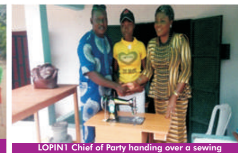
LOPIN1 Chief of Party handing over a sewing machine to an empowered adolescent in Rivers state