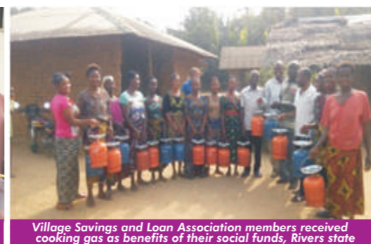
Village Savings and Loan Association members received cooking gas as benefits of their social funds, Rivers state