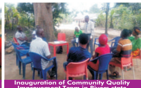
Inauguration of Community Quality Improvement Team in Rivers state