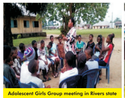
Adolescent Girls Group meeting in Rivers state