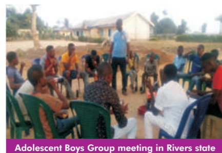
Adolescent Boys Group meeting in Rivers state