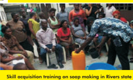
Skill acquisition training on soap making in Rivers state