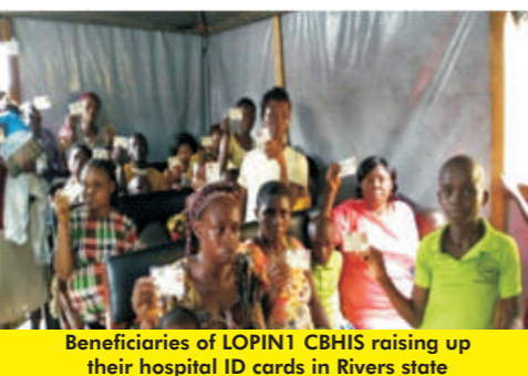
Beneficiaries of LOPIN1 CBHIS raising up their hospital ID cards in Rivers state