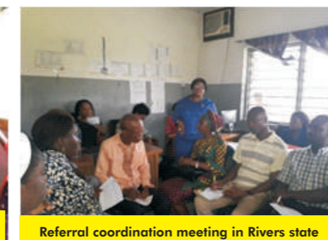
Referral coordination meeting in Rivers state