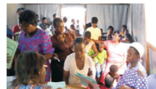
Folder/card opening for CBHIS beneficiaries at Obio Cottage Hospital, Rivers state.

The ARFH-LOPIN 1 project provided enabling environment for increased uptake of health services through facilitated referrals and logistic support for indigent enrollees. A total of 53,443 children received the required health support services with improved treatment outcome. To further strengthen health seeking behaviour of vulnerable households and increase uptake of services, the ARFH-LOPIN 1 project pioneered the pilot implementation of Community Based Health Insurance Scheme (CBHIS) in Rivers states, with support from USAID. A total of 865 beneficiaries are currently accessing free health services through the elimination of user fees. Services covered under the CBHIS include the management of childhood malnutrition, malaria, enteric fevers, pneumonia, uncomplicated peptic and duodenal ulcers, respiratory infections, ear infections; immunizations, minor surgical procedures catheterization; and treatment of minor ailments.