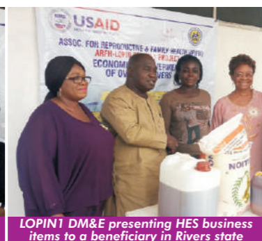
LOPIN1 DM&E presenting HES business items to a beneficiary in Rivers state